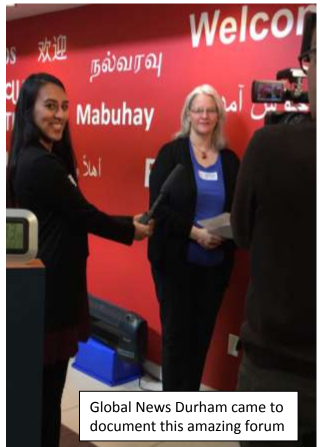
Global News Durham came to document this amazing forum